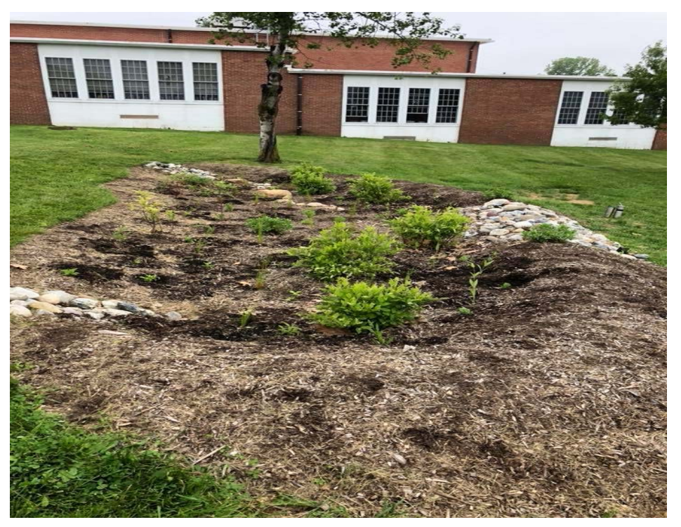
After, Rain Garden, 2551 Belvidere Road, Phillipsburg, NJ