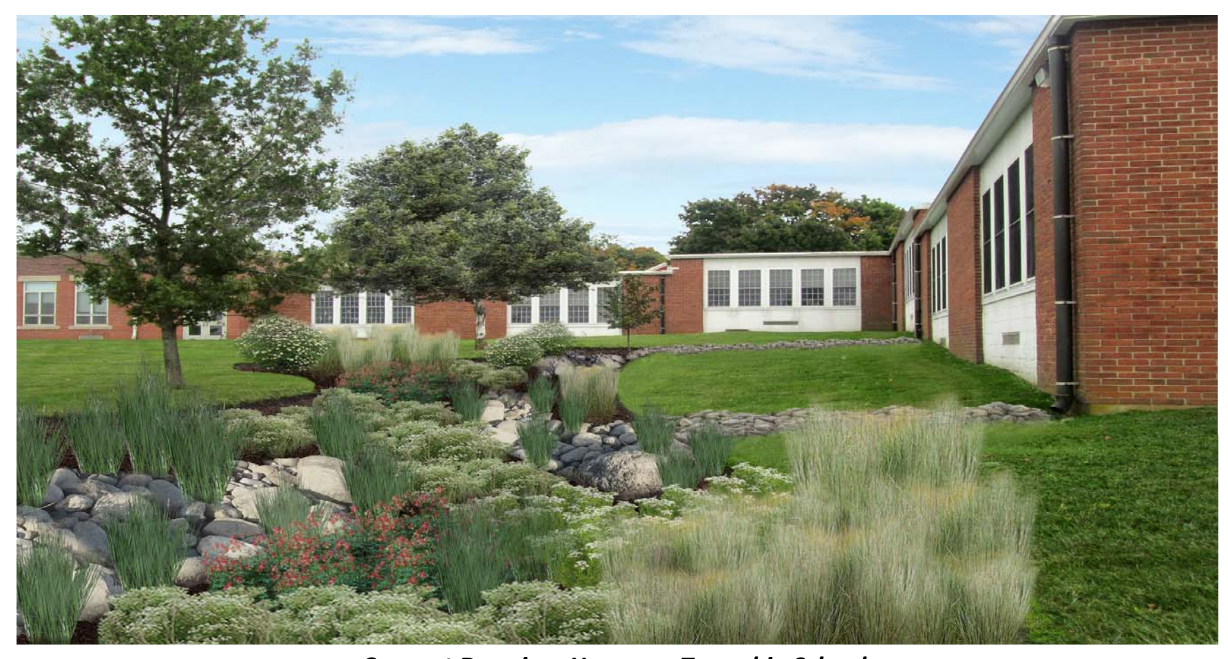
Concept Drawing, Harmony Township School, 2551 Belvidere Road, Phillipsburg, NJ