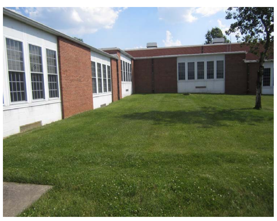
Before, Harmony Township School, 2551 Belvidere Road, Phillipsburg, NJ